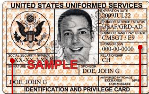
DD Form 1173