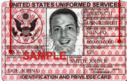
DD Form 1173-1